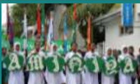
Aminiya School Parade 2014