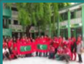
Aminiyan's showing their love for the nation by supporting the Dhivehi football team