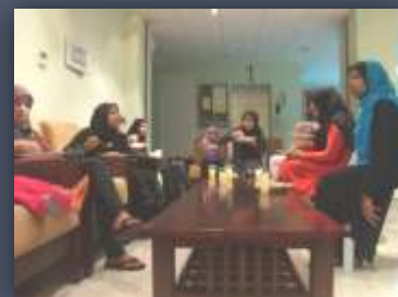
Left & Top: From MLA social event, 2011