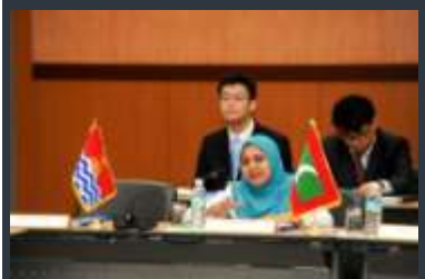
From the group discussion session