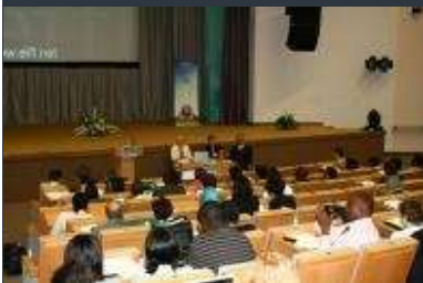
EIFL 2011 General Assembly June 26-28