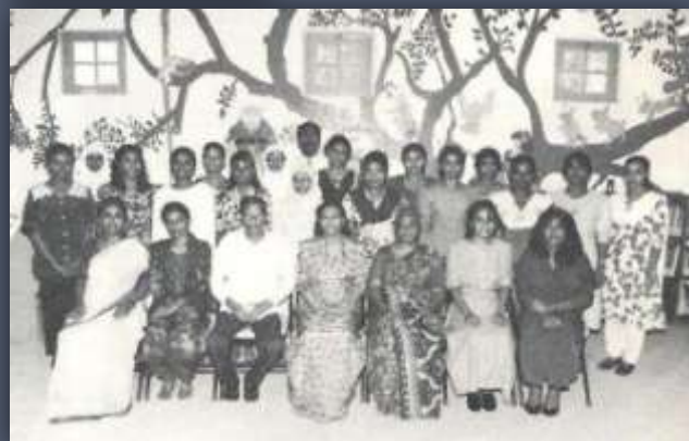
MLA joins in the celebration of the National Library's 50 th Anniversary, 1995