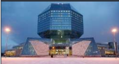
National Library of Belarus hosted the EIFL 2011 General Assembly, June 26-28