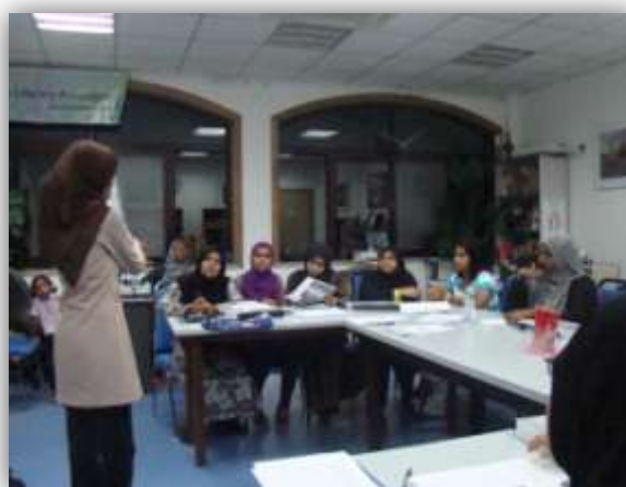
MLA Workshop on Library Classification, 2011 held at the Institute of Library and Information Services, NLM