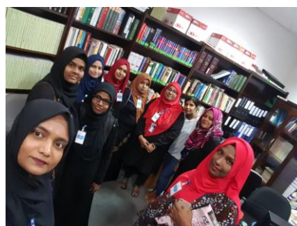
ACLIS (ADVANCE CERTIFICATE IN LIBRARY & INFORMATION SERVICES) STUDENTS VISITED PARLIAMENT LIBRARY

Getting to spend time with knowledgeable lecturers. I have benefited immensely from this. Also, it was great to spend time with people from different places with different backgrounds. The lecturers were all very friendly and approachable. The coordinator also helped us immensely, and she was the best coordinator a batch of students could ever have.